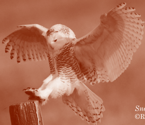
Snowy Owl