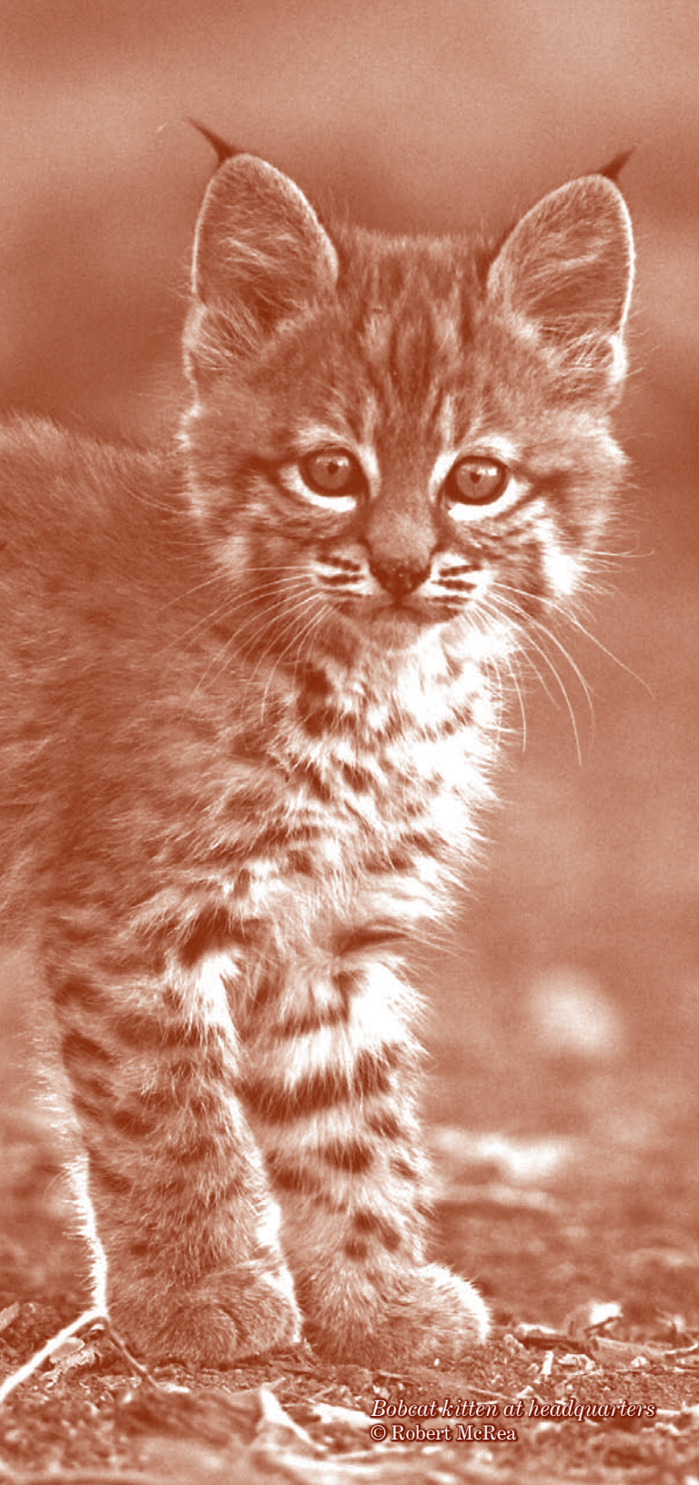
Bobcat kitten at headquarters