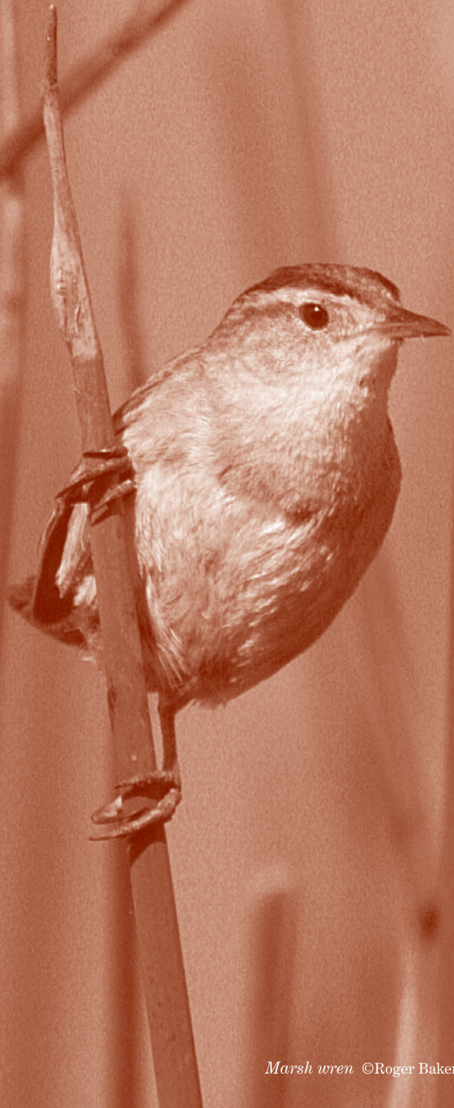
Marsh wren