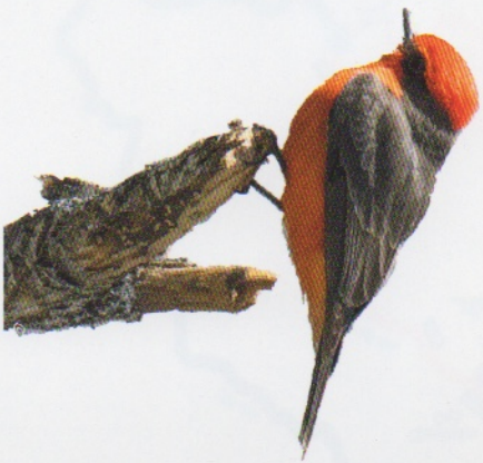
Vermilion Flycatcher